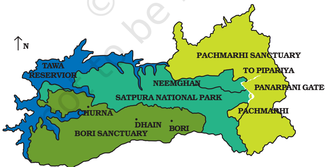
Fig. 7.1 : Pachmarhi Biosphere Reserve