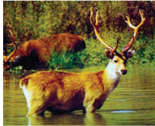
Fig. 7.6 : Barasingha

animals has become difficult because of disturbances in their natural habitat. Professor Ahmad tells them that in order to protect plants and animals strict rules are imposed in all National Parks. Human activities such as grazing, poaching, hunting, capturing of animals or collection of firewood, medicinal plants, etc. are not allowed