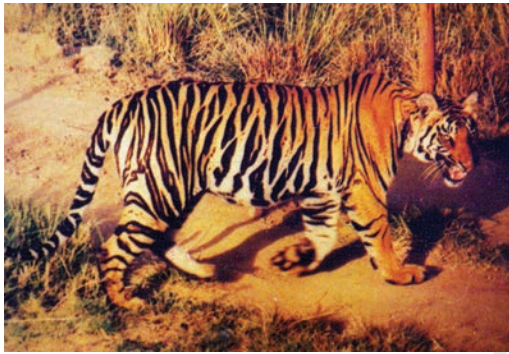
Fig. 7.4 : Tiger

Tiger (Fig. 7.4) is one of the many species which are slowly disappearing from our forests. But, the Satpura Tiger Reserve is unique in the sense that a significant increase in the population of tigers has been seen here. Once upon a time, animals like lions, elephants, wild