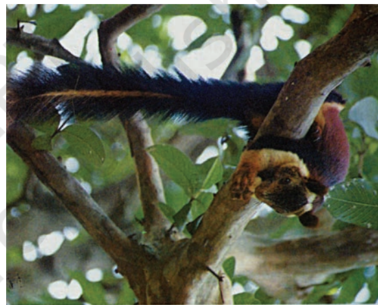
Fig. 7.3 (b) : Giant squirrel

endemic flora of the Pachmarhi Biosphere Reserve. Bison, Indian giant squirrel [Fig. 7.3 (b)] and flying squirrel are endemic fauna of this area. Professor Ahmad explains that the destruction of their habitat, increasing population and introduction of new species may affect the natural habitat of endemic species and endanger their existence.