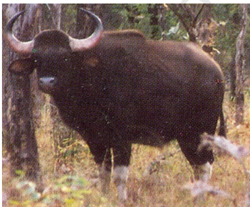
Fig. 7.5 : Wild buffalo

buffaloes (Fig. 7.5) and barasingha (Fig. 7.6) were also found in the Satpura National Park. Animals whose numbers are diminishing to a level that they might face extinction are known as the endangered animals . Boojho is reminded of the dinosaurs which became extinct a long time ago. Survival of some