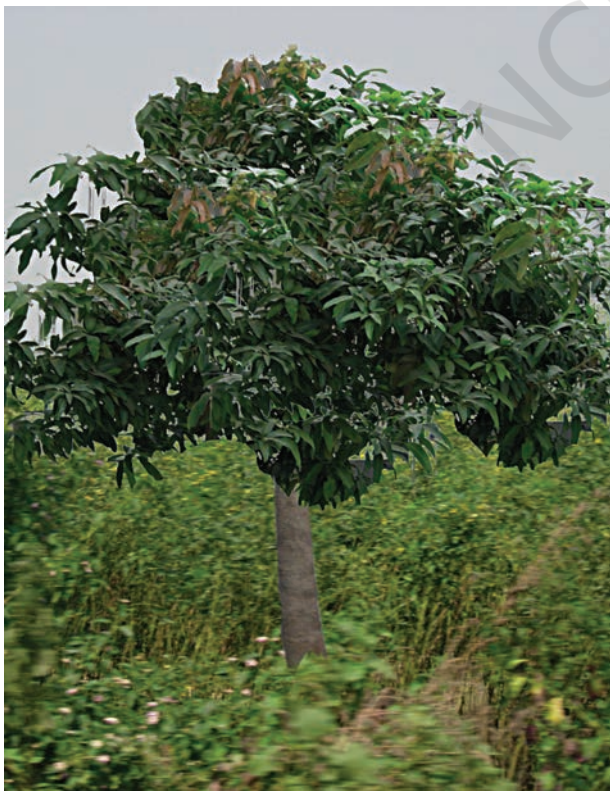
Fig. 7.3 (a) : Wild Mango

Madhavji shows sal and wild mango (Fig. 7.3 (a)) as two examples of the