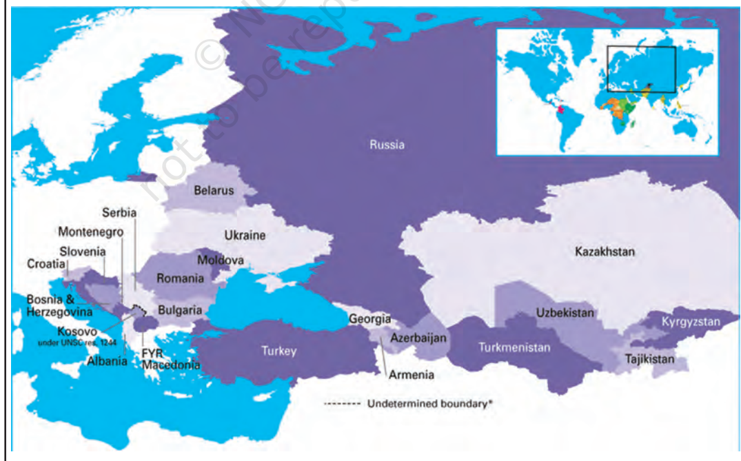
MAP OF CENTRAL, EASTERN EUROPE AND THE COMMONWEALTH OF INDEPENDENT STATES

Locate the Central Asian Republics on the map.