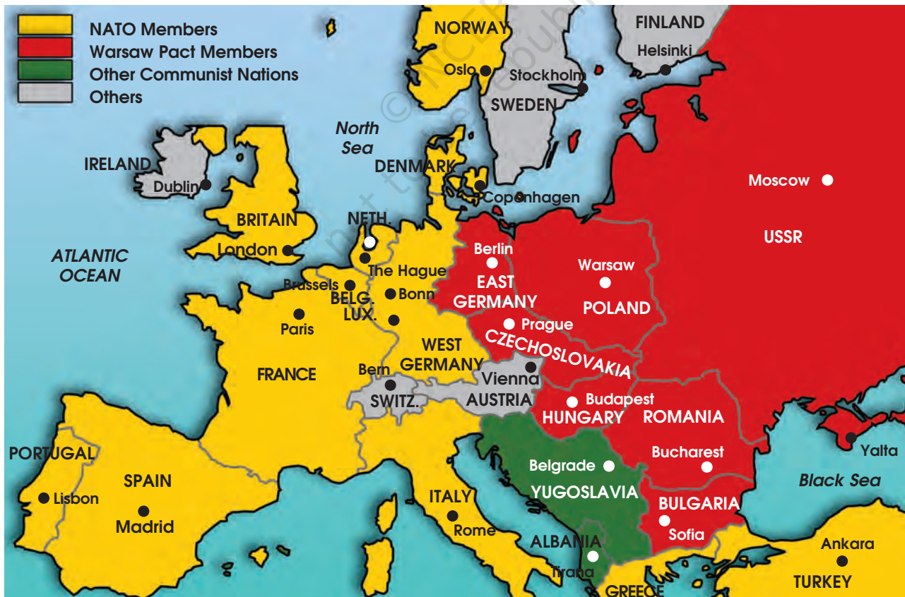
Map showing the way Europe was divided into rival alliances during the Cold War