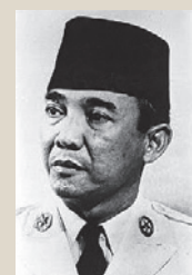
Sukarno (1901-70) First President of Indonesia (1945-65); led the freedom struggle; espoused the causes of socialism and anti-imperialism; organised the Bandung Conference; overthrown in a military coup.