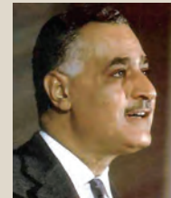
Gamal Abdel Nasser (1918-70) Ruled Egypt from 1952 to 1970; espoused the causes of Arab nationalism, socialism and anti-imperialism; nationalised the Suez Canal, leading to an international conflict in 1956.