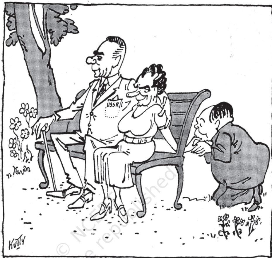
POLITICAL SPRING China makes overtures to the USA.

Drawn by well-known Indian cartoonist Kuttly, these two cartoons depict an Indian view of the Cold War. The first cartoon was drawn when the US entered into a secret understanding with China, keeping the USSR in the dark. Find out more about the characters in the cartoon. The second cartoon depicts the American misadventure in Vietnam. Find out more about the Vietnam War.