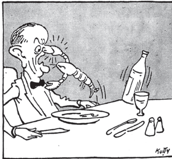
FOOD FOR THOUGHT President Johnson is in more troubles over Vietnam.