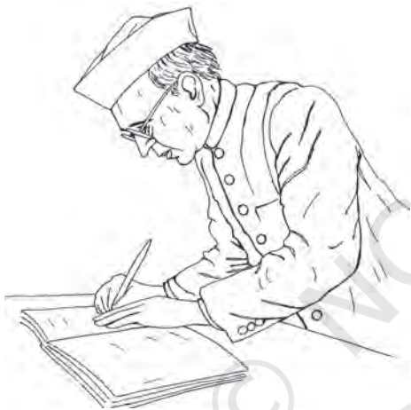
Jawaharlal Nehru CAD, Vol. VI, p. 734

We have already seen that President is the formal head of the government. In this formal sense, the President has wide ranging executive, legislative, judicial and emergency powers. In a parliamentary system, these powers are in reality used by the President only on the advice of the Council of Ministers. The Prime Minister and the Council of Ministers have support of the majority in the Lok Sabha and they are the real executive. In most of the cases, the President has to follow the advice of the Council of Ministers.