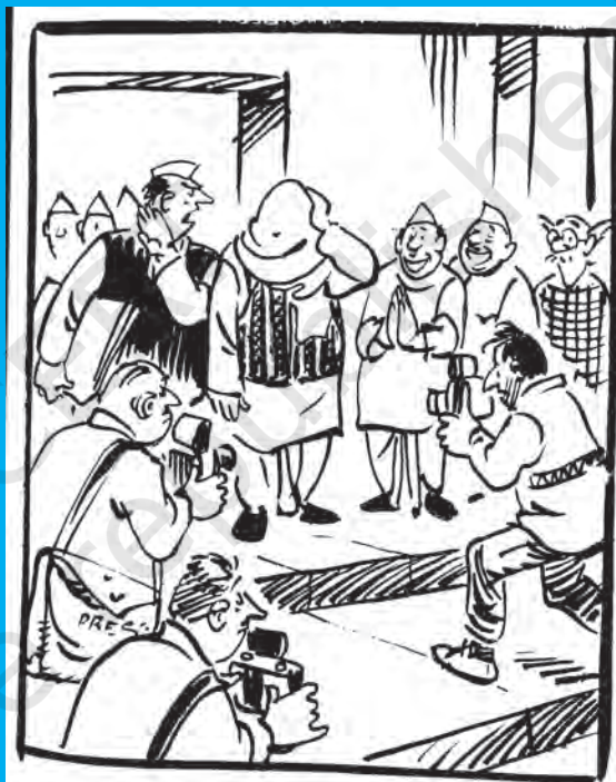
Forget that old habit and face the camera! Remember you have been nominated and are standing for the election now!

Should a person accused of a serious crime be barred from contesting elections?