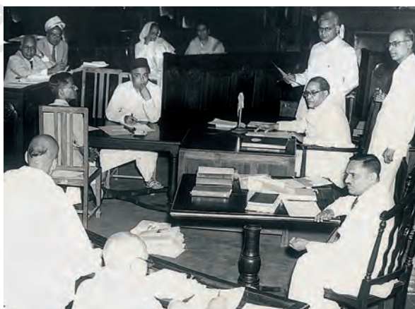
Dr. B.R. Ambedkar presiding over a discussion in the Constituent Assembly

Dr. B.R. Ambedkar CAD, Vol. VII, p.37, 4 November 1948