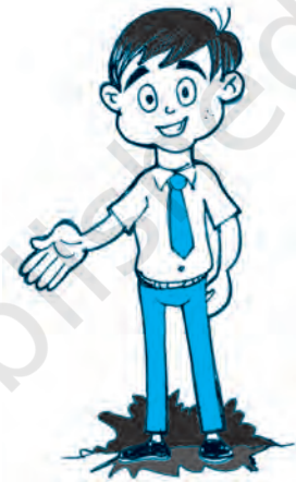
This group is very much like the people of my village.

for all their diversity, this group has to live together. They are dependent upon each other in various ways. They require the cooperation of each other. What will enable the group to live together peacefully?