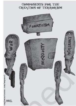
Components for the Creation of Terrorism

List the names of a few Nobel Peace Prize winners. Write a note on any one of them.