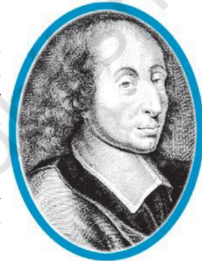
Blaise Pascal (1623-1662)

In earlier classes, we have learnt how to find the squares and cubes of binomials like a + b and a - b . Using them, we could evaluate the numerical values of numbers like (98)^2 = (100 - 2)^2 , (999)^3 = (1000 - 1)^3 , etc. However, for higher powers like (98)^5 , (101)^6 , etc., the calculations become difficult by using repeated multiplication. This difficulty was overcome by a theorem known as binomial theorem. It gives an easier way to expand (a + b)^n , where n is an integer or a rational number. In this Chapter, we study binomial theorem for positive integral indices only.