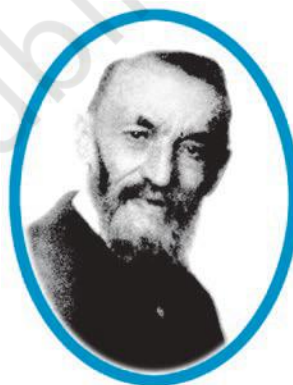
G. Peano (1858-1932)

In contrast to deduction, inductive reasoning depends on working with each case, and developing a conjecture by observing incidences till we have observed each and every case. It is frequently used in mathematics and is a key aspect of scientific reasoning, where collecting and analysing data is the norm. Thus, in simple language, we can say the word induction means the generalisation from particular cases or facts.