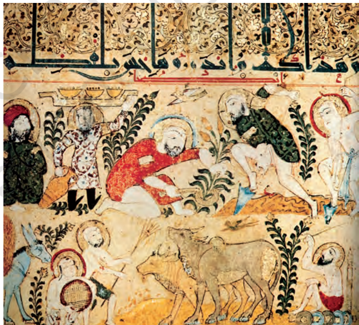
Grain harvesting; the labourers' lunch is being brought on a tray.

Agricultural prosperity went hand in hand with political stability. In many areas, especially in the Nile valley, the state supported irrigation systems, the construction of dams and canals, and the digging of wells (often equipped with waterwheels or noria ), all of which were crucial for good harvests. Islamic law gave tax concessions to people who brought land under cultivation. Through peasant initiatives and state support, cultivable land expanded and productivity rose, even in the absence of major technological changes. Many new crops such as cotton, oranges, bananas, watermelons, spinach and brinjals ( badinjan ) were grown and even exported to Europe.