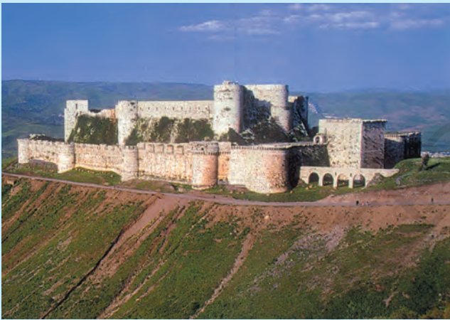
A crusader castle in Syria. Built during the crusades (1110), it was an important base to attack Arab-controlled areas. The towers and aqueducts were built by the Mamluk sultan, Baybars, when he captured it in 1271.

Here is an example. Once I sent a man to Antioch on business. At that time,