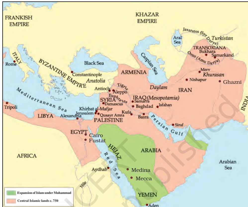
MAP 1: The Islamic Lands

easier for the Arabs to annex territories through wars and treaties. In three successful campaigns (637-642), the Arabs brought Syria, Iraq, Iran and Egypt under the control of Medina. Military strategy, religious fervour and the weakness of the opposition contributed to the success of the Arabs. Further campaigns were launched by the third caliph, Uthman, to extend the control to Central Asia. Within a decade of the death of Muhammad, the Arab-Islamic state controlled the vast territory between the Nile and the Oxus. These lands remain under Muslim rule to this day.