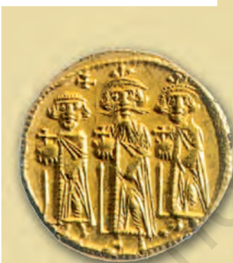
Byzantine gold solidus (denarius aureus) showing the emperor Heraclius and his two sons.

The three coin specimens show the transition from Byzantine to Arab-Islamic coinage. On the second coin, the bearded and long-haired caliph is dressed in traditional Arab robes and is holding a sword. It is the first extant portrait of a Muslim. It is also unique because later there developed an antipathy towards the representation of living beings in art and craft. Abd al-Malik's reform of coinage was linked with his reorganisation of state finances. It proved so successful that for hundreds of years, coins were struck according to the pattern and weight of the third specimen.