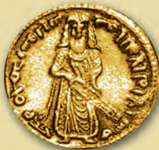
Portrait gold dinar struck by Abd al-Malik with his name and image.