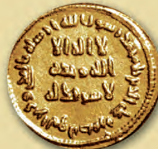
The reformed dinar was purely epigraphic. It carries the kalima: 'There is no God but Allah and He has no partner (sharik)'