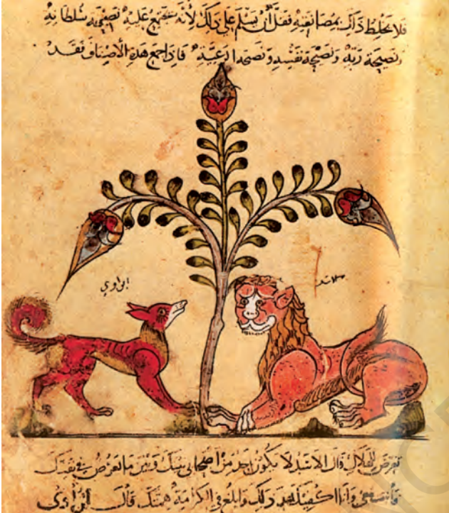
Dimna is talking to the lion (asad) in this miniature painting of a thirteenth-century Arabic manuscript.

a patron, or express the thoughts of the philosopher. The rubai reached its zenith in the hands of Umar Khayyam (1048-1131), also an astronomer and mathematician, who lived at various times in Bukhara, Samarqand and Isfahan.