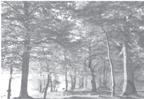
Figure 5.3 : Deciduous Forests

These are the most widespread forests in India. They are also called the monsoon forests. They spread over regions which receive rainfall between 70-200 cm. On the basis of the availability of water, these forests are further divided into moist and dry deciduous.