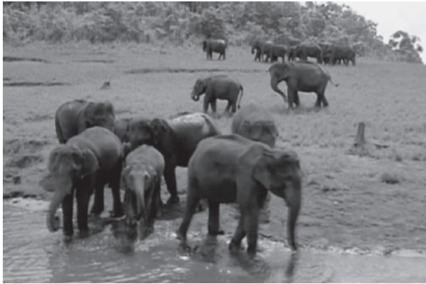
Figure 5.7 : Elephants in their Natural Habitat