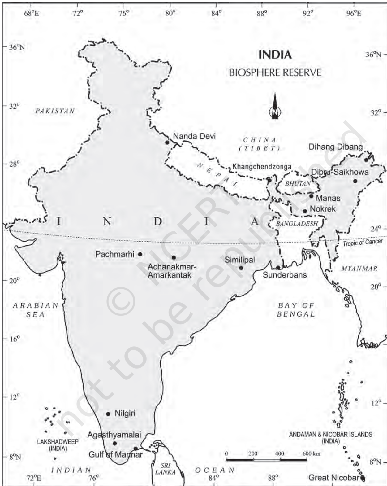
Figure 5.9 : India : Biosphere Reserves