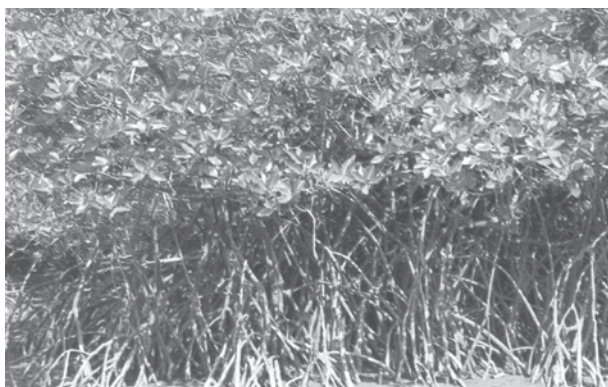
Figure 5.6 : Mangrove Forests

They consist of a number of salt-tolerant species of plants. Crisscrossed by creeks of stagnant water and tidal flows, these forests give shelter to a wide variety of birds.