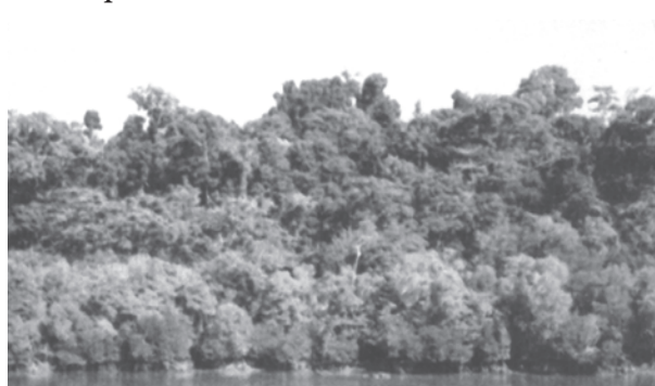
Figure 5.1 : Evergreen Forest

The semi evergreen forests are found in the less rainy parts of these regions. Such forests have a mixture of evergreen and moist deciduous trees. The undergrowing climbers provide an evergreen character to these forests. Main species are white cedar, hollock and kail.