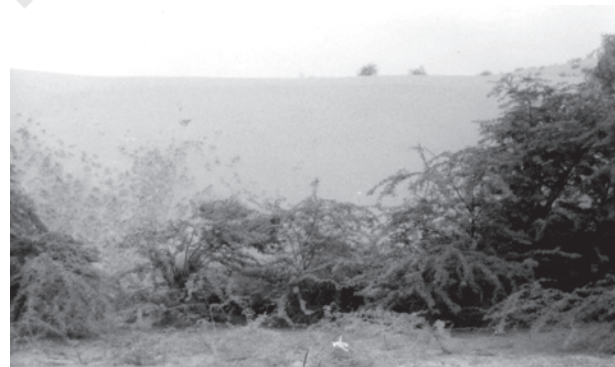
Figure 5.4 : Tropical Thorn Forests

Tropical thorn forests occur in the areas which receive rainfall less than 50 cm. These consist of a variety of grasses and shrubs. It includes semi-arid areas of south west Punjab, Haryana, Rajasthan, Gujarat, Madhya Pradesh and Uttar Pradesh. In these forests, plants remain leafless for most part of the year and give an expression of scrub vegetation. Important species found are babool, ber , and wild date palm, khair, neem, khejri, palas , etc. Tussocky grass grows upto a height of 2 m as the under growth.