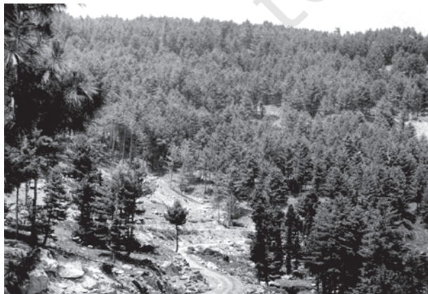
Figure 5.5 : Montane Forests

The Himalayan ranges show a succession of vegetation from the tropical to the tundra, which change in with the altitude. Deciduous forests are found in the foothills of the Himalayas. It is succeeded by the wet temperate type of forests between an altitude of 1,000-2,000 m. In the higher hill ranges of northeastern India, hilly areas of West Bengal and Uttaranchal, evergreen broad leaf trees such as oak and chestnut are predominant. Between 1,500-1,750 m, pine forests are also well-developed in this zone, with Chir Pine as a very useful commercial tree. Deodar, a highly valued endemic species grows mainly in the western part of the Himalayan range. Deodar is a durable wood mainly used in construction activity. Similarly, the chinar and the walnut, which sustain the famous Kashmir handicrafts, belong to this zone. Blue pine and spruce appear at altitudes of 2,225-3,048 m. At many places in this zone, temperate grasslands are also found. But in the higher reaches there is a transition to Alpine forests and pastures. Silver firs, junipers, pines, birch and rhododendrons, etc. occur between 3,000-4,000 m. However, these pastures are used extensively for transhumance by tribes like the Gujjars, the Bakarwals, the Bhotiyas and the Gaddis. The southern slopes of the Himalayas carry a thicker vegetation cover because of relatively higher precipitation than the drier north-facing slopes. At higher altitudes, mosses and lichens form part of the tundra vegetation.