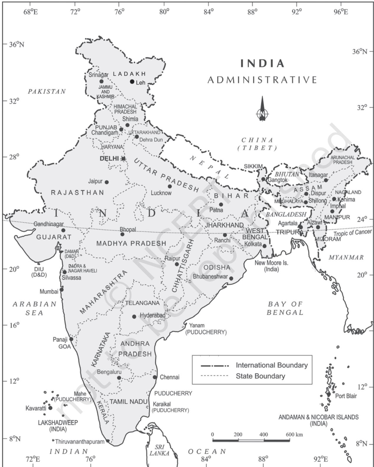
Figure 1.1 : India : Administrative Divisions