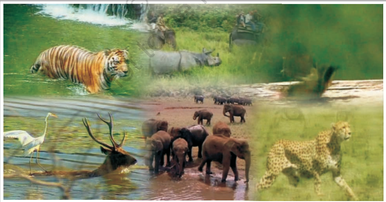
Figure 8.3 : Wildlife

In order to protect them many national parks, sanctuaries and biosphere reserves have been set up. The Government