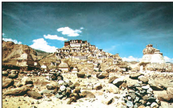
Fig. 9.5: Thiksey Monastery

The finest cricket bats are made from the wood of the willow trees.