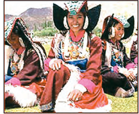
Fig. 9.6: Ladakhi Women in Traditional Dress

Life of people is undergoing change due to modernisation. But the people of Ladakh have over the centuries learned to live in balance and harmony with nature. Due to scarcity of resources like water and fuel, they are used with reverence and care. Nothing is discarded or wasted.