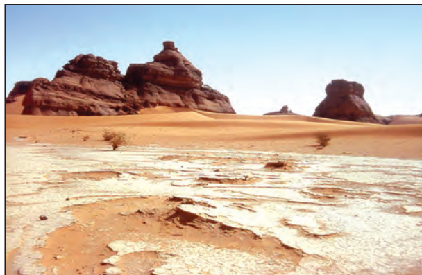
Fig. 9.1: The Sahara Desert

Look at the map of the world and the continent of Africa. Locate the Sahara desert covering a large part of North Africa. It is the world's largest desert. It has an area of around 8.54 million sq. km. Do you recall that India has an area of 3.2 million sq. km? The Sahara desert touches eleven countries. These are Algeria, Chad, Egypt, Libya, Mali, Mauritania, Morocco, Niger, Sudan, Tunisia and Western Sahara.