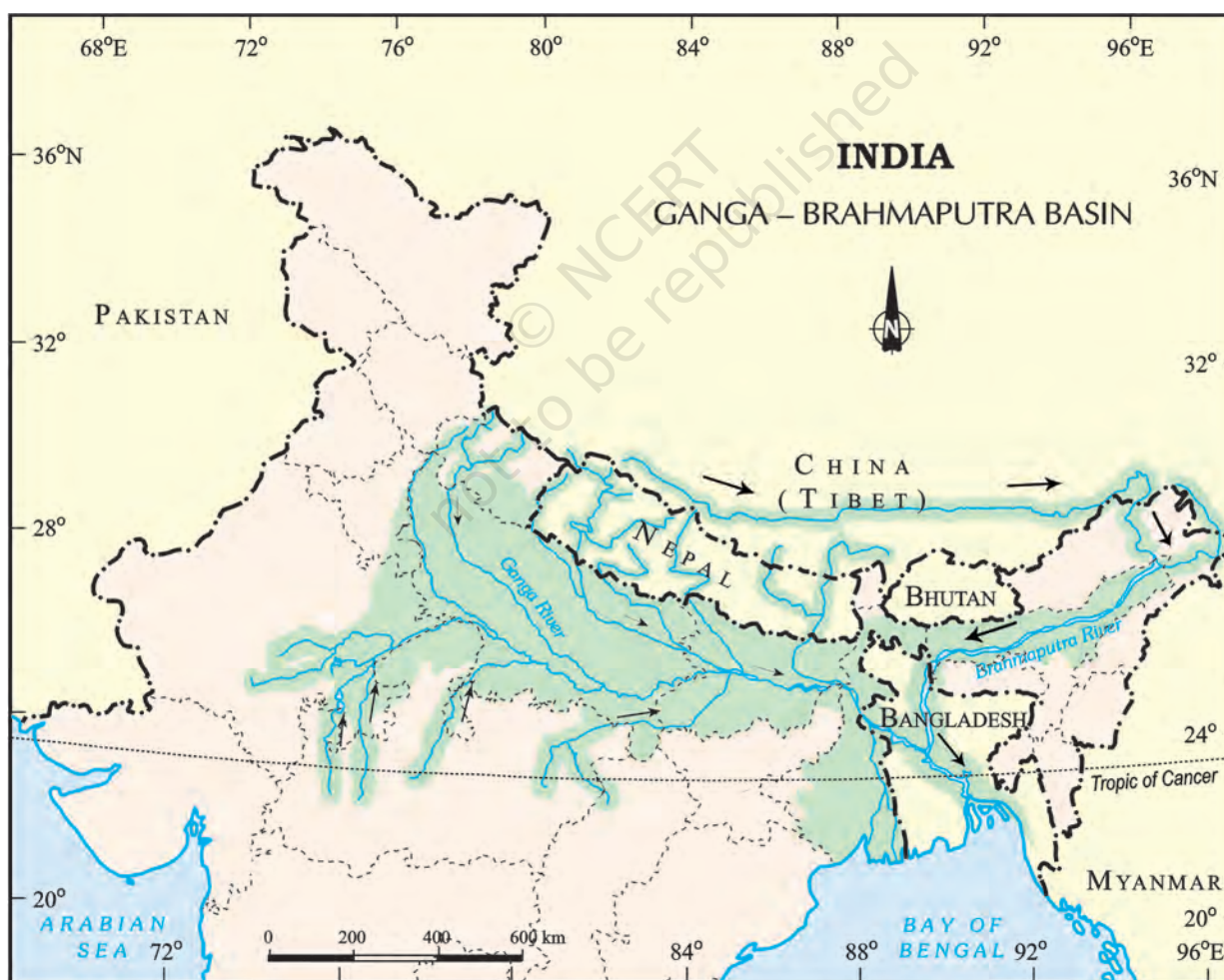
Fig. 8.8: Ganga-Brahmaputra Basin

The plains of the Ganga and the Brahmaputra, the mountains and the foothills of the