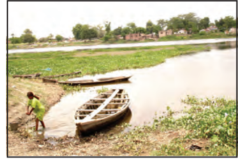
A Polluted Lake

to sell in the market. They have even begun supply to the neighbouring town. The community is living in harmony with nature. As long as the pollutants from nearby towns do not find their way into the lake waters, the fish cultivation will not face any threat.