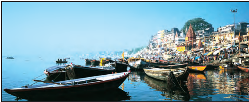
Fig. 8.13: Varanasi along the River Ganga

The Ganga-Brahmaputra plain has several big towns and cities. The cities of Allahabad, Kanpur, Varanasi, Lucknow, Patna and Kolkata all with the population of more than ten lakhs are located along the River Ganga (Fig. 8.13). The wastewater from these towns