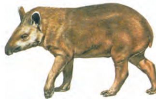
Fig. 8.5 : Tapir

are found here (Fig. 8.5). Various species of reptiles and snakes also thrive in these jungles. Crocodiles, snakes, pythons abound. Anaconda and boa constrictor are some of the species. Besides, the basin is home to thousands of species of insects. Several species of fishes including the flesh-eating Piranha fish is also found in the river. This basin is thus extraordinarily rich in the variety of life found there.