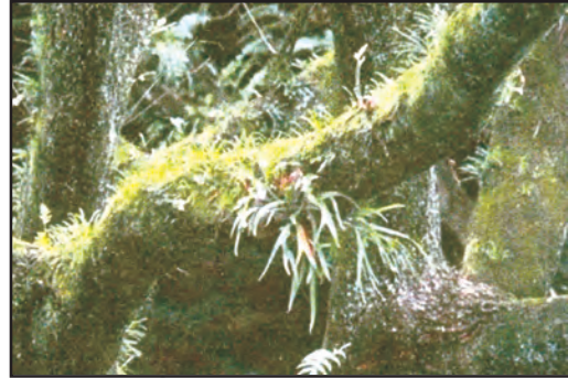
Fig. 8.3 : The Amazon Forest

As it rains heavily in this region, thick forests grow (Fig. 8.3). The forests are in fact so thick that the dense “roof” created by leaves and branches does not allow the sunlight to reach the ground. The ground remains dark and damp. Only shade tolerant vegetation may grow here. Orchids, bromeliads grow as plant parasites.