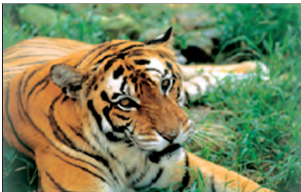
Fig. 8.14: Tiger in Manas Wildlife sanctuary

All the four ways of transport are well developed in the Ganga-Brahmaputra basin. In the plain areas the roadways and railways transport the people from one place to another. The waterways, is an effective means of transport particularly along the rivers. Kolkata is an important port on the River Hooghly. The plain area also has a large number of airports.