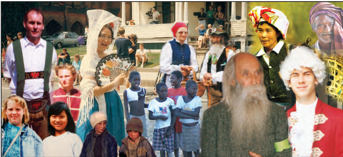
Fig. 8.1: People from various parts of the world

Renuka was excited. Shrikant Uncle was home after a gap of nearly four months. He was a wildlife photographer and travelled widely. Renuka's interest in wildlife and forests began at an early age, when her uncle introduced her to books on nature. Pictures of distant lands and people, who lived there, always fascinated her.