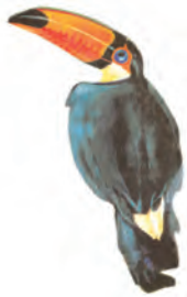
Fig. 8.4 : Toucans

The rainforest is rich in fauna. Birds such as toucans (Fig. 8.4), humming birds, bird of paradise with their brilliantly coloured plumage, oversized bills for eating make them different from birds we commonly see in India. These birds also make loud sounds in the forests. Animals like monkeys, sloth and ant-eating tapirs