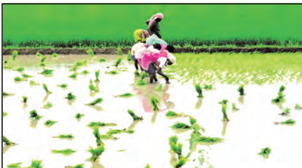
Fig. 8.9 : Paddy Cultivation

The vegetation cover of the area varies according to the type of landforms. In the Ganga and Brahmaputra plain tropical deciduous trees grow, along with teak, sal and peepal. Thick bamboo groves are common in the Brahmaputra plain. The delta area is covered with the