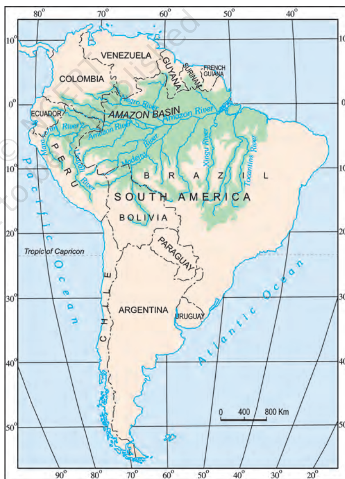
Fig. 8.2: The Amazon Basin in South America

Name the countries of the basin through which the equator passes.