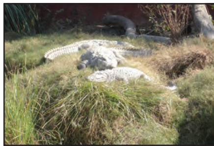
Fig. 8.12 : Crocodiles