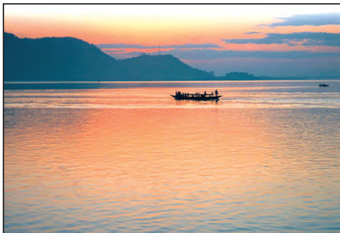
Fig. 8.7 Brahmaputra river

The tributaries of rivers Ganga and Brahmaputra together form the Ganga-Brahmaputra basin in the Indian subcontinent (Fig. 8.8). The basin lies in the sub-tropical region that is situated between 10°N to 30°N latitudes. The tributaries of the River Ganga like the Ghaghra, the Son, the Chambal, the Gandak, the Kosi and the tributaries of Brahmaputra drain it. Look at the atlas and find names of some tributaries of the River Brahmaputra.