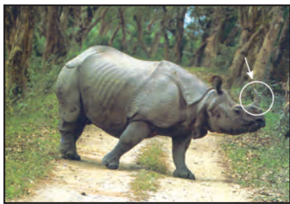
Fig. 8.11 : One horned rhinoceros

There is a variety of wildlife in the basin. Elephants, tigers, deer and monkeys are common. The one-horned rhinoceros is found in the Brahmaputra plain. In the delta area, Bengal tiger, crocodiles and alligator are found. Aquatic life abounds in the fresh river waters, the lakes and the Bay of Bengal Sea. The most popular varieties of the fish are the rohu, catla and hilsa. Fish and rice is the staple diet of the people living in the area.