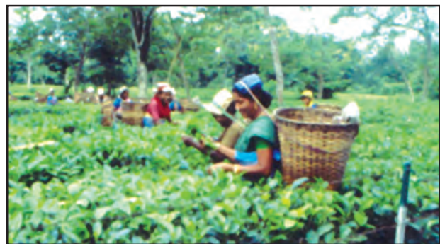
Fig. 8.10 : Tea Garden in Assam