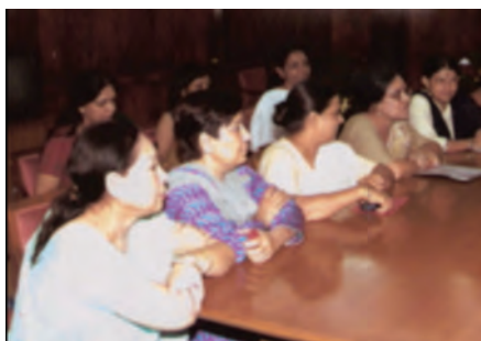
The above photo shows a few women Members of Parliament.

Why do you think there are so few women in Parliament? Discuss.