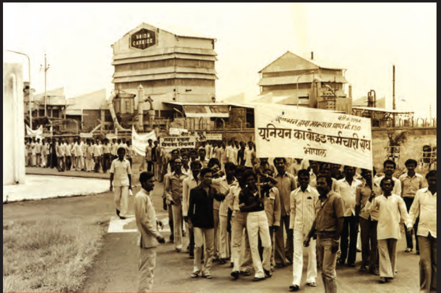
Members of UC Employees Union protesting

The disaster was not an accident. UC had deliberately ignored the essential safety measures in order to cut costs. Much before the Bhopal disaster, there had been incidents of gas leak killing a worker and injuring several.