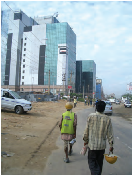
Accidents are common to construction sites. Yet, very often, safety equipment and other precautions are ignored.