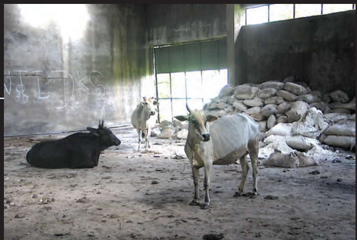
Bags of chemicals lie strewn around the UC plant

UC stopped its operations, but left behind tons of toxic chemicals. These have seeped into the ground, contaminating water. Dow Chemical, the company who now owns the plant, refuses to take responsibility for clean up.