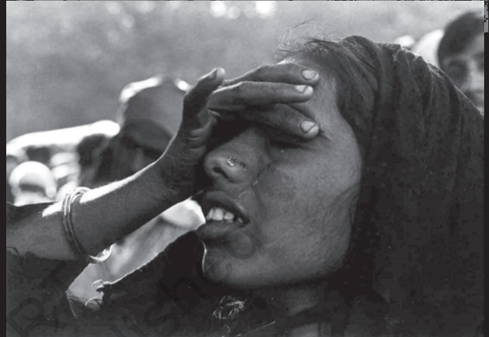
The next morning