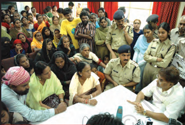
Gas victims with the Gas Relief Minister

Despite the overwhelming evidence pointing to UC as responsible for the disaster, it refused to accept responsibility.