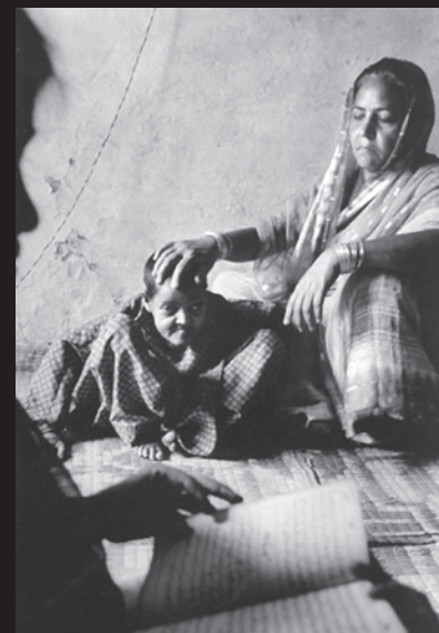
A child severely affected by the gas

Most of those exposed to the poison gas came from poor, working-class families, of which nearly 50,000 people are today too sick to work. Among those who survived, many developed severe respiratory disorders, eye problems and other disorders. Children developed peculiar abnormalities, like the girl in the photo.