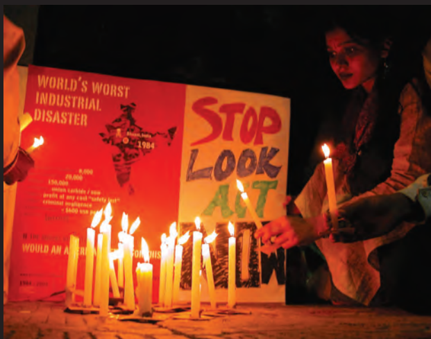
The struggle for justice goes on...

24 years later, people are still fighting for justice: for safe drinking water, for health-care facilities and jobs for the people poisoned by UC. They also demand that Anderson, the UC chairman who faces criminal charges, be prosecuted.