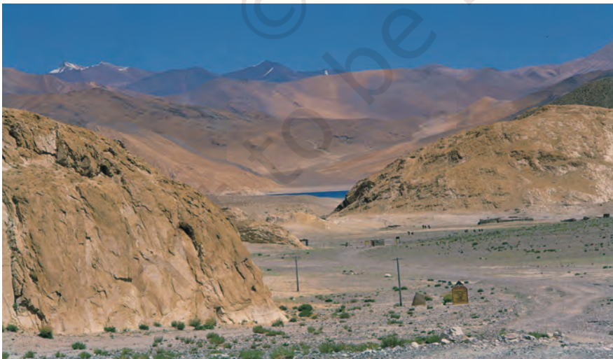
The dry barren landscape of the mountainous desert of Ladakh.

Ladakh is a desert in the mountains in the east of Jammu and Kashmir. Very little agriculture is possible here since this region does not receive any rain and is covered in snow for a large part of the year. There are very few trees that can grow in the region. For drinking water, people depend on the melting snow during the summer months.