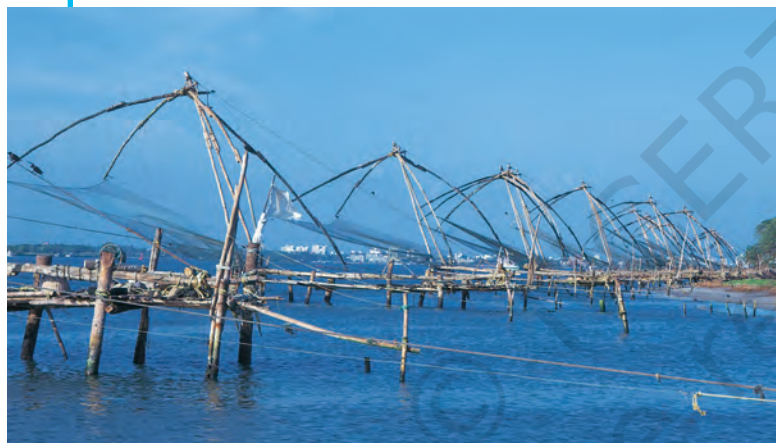
Chinese Fishing Nets

Even the utensil used for frying is called the cheenachatti , and it is believed that the word cheen could have come from China. The fertile land and climate are suited to growing rice and a majority of people here eat rice, fish and vegetables.