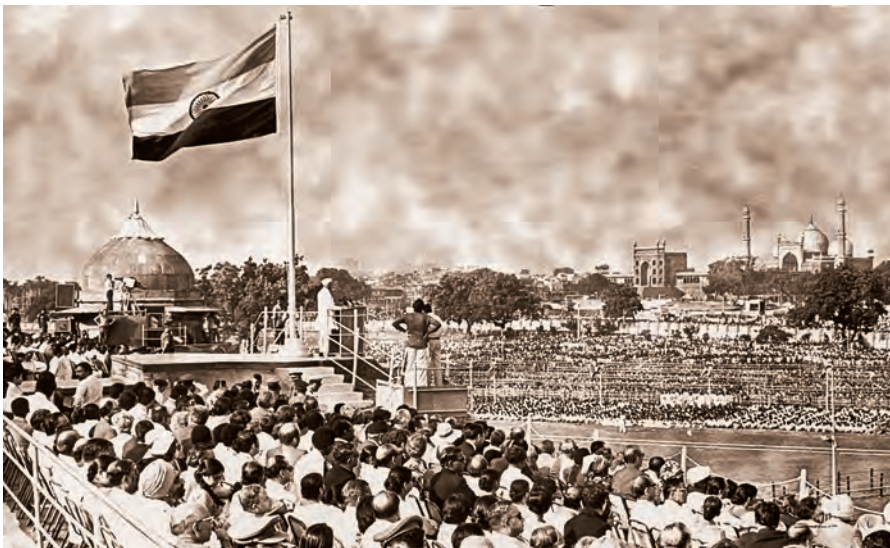
Pt. Nehru delivering an Independence Day speech

Songs and symbols that emerged during the freedom struggle serve as a constant reminder of our country's rich tradition of respect for diversity. Do you know the story of the Indian flag? It was used as a symbol of protest against the British by people everywhere.