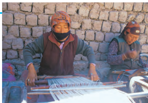
Woman weaving a pashmina shawl

Buddhism reached Tibet via Ladakh. Ladakh is also called Little Tibet. Islam was introduced in this region more than four hundred years ago and there is a significant Muslim population here. Ladakh has a very rich oral tradition of songs and poems. Local versions of the Tibetan national epic the Kesar Saga are performed and sung by both Muslims and Buddhists.